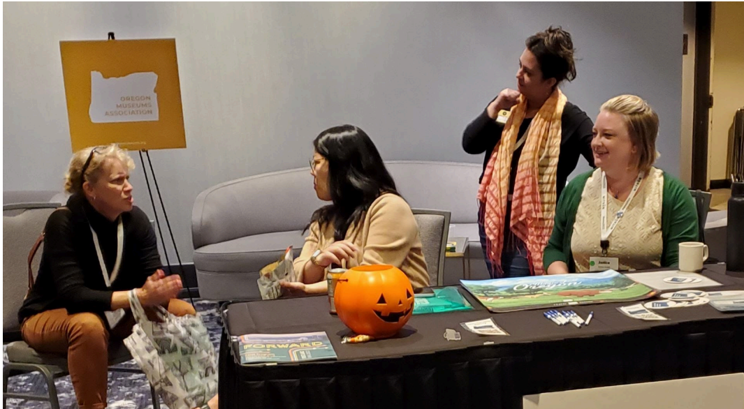
Conference folks at the OMA Lounge.

The 2022 WMA Annual Meeting, in partnership with OMA, was a success. We had a great selection of sessions, lots of networking time and innovative ways to meet and discuss topics, robust registration and supportive sponsors. Thanks to everyone who attended and made this possible!