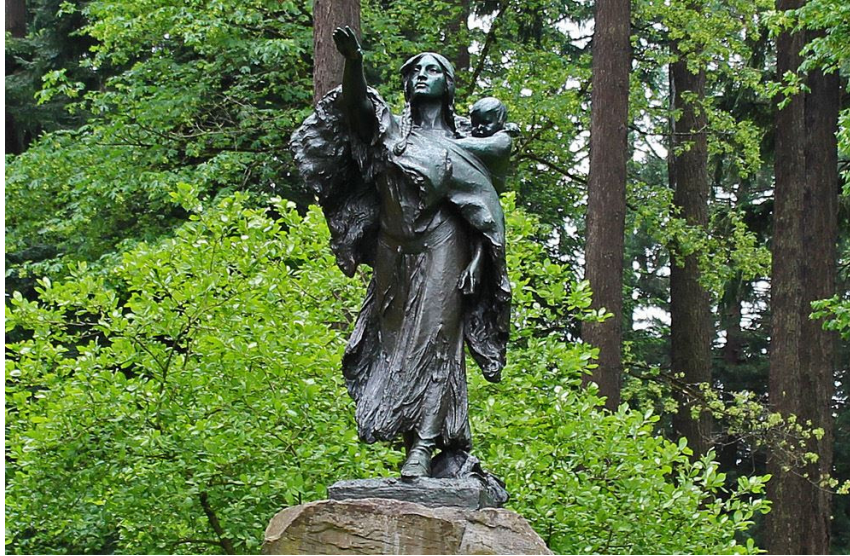
Statue of Sacajewea in Washington Park, Portland, OR.

The National Monument Audit , created by Monument Lab and The Andrew W. Mellon Foundation, is a database of half million records of historic properties created and maintained by federal, state, local, tribal, institutional, and publicly assembled sources. Key findings are below: