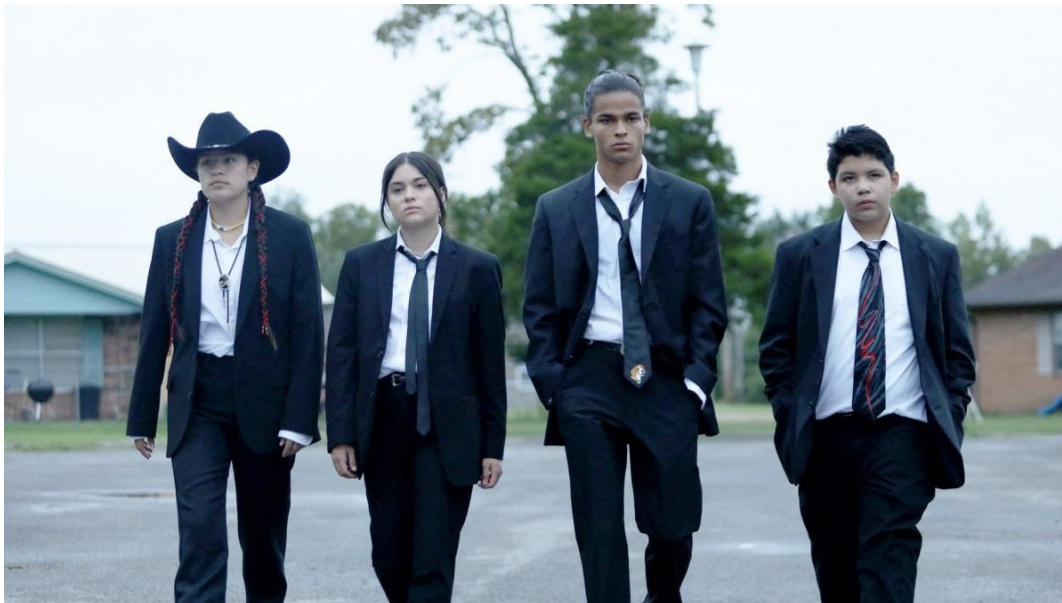
Cast of FX's television series Reservation Dogs .

November is National Native American Heritage Month . It started at the turn of the century as an effort to gain a day of recognition for the significant contributions the first Americans made to the establishment and growth of the US. This has resulted in a whole month being designated for that purpose.