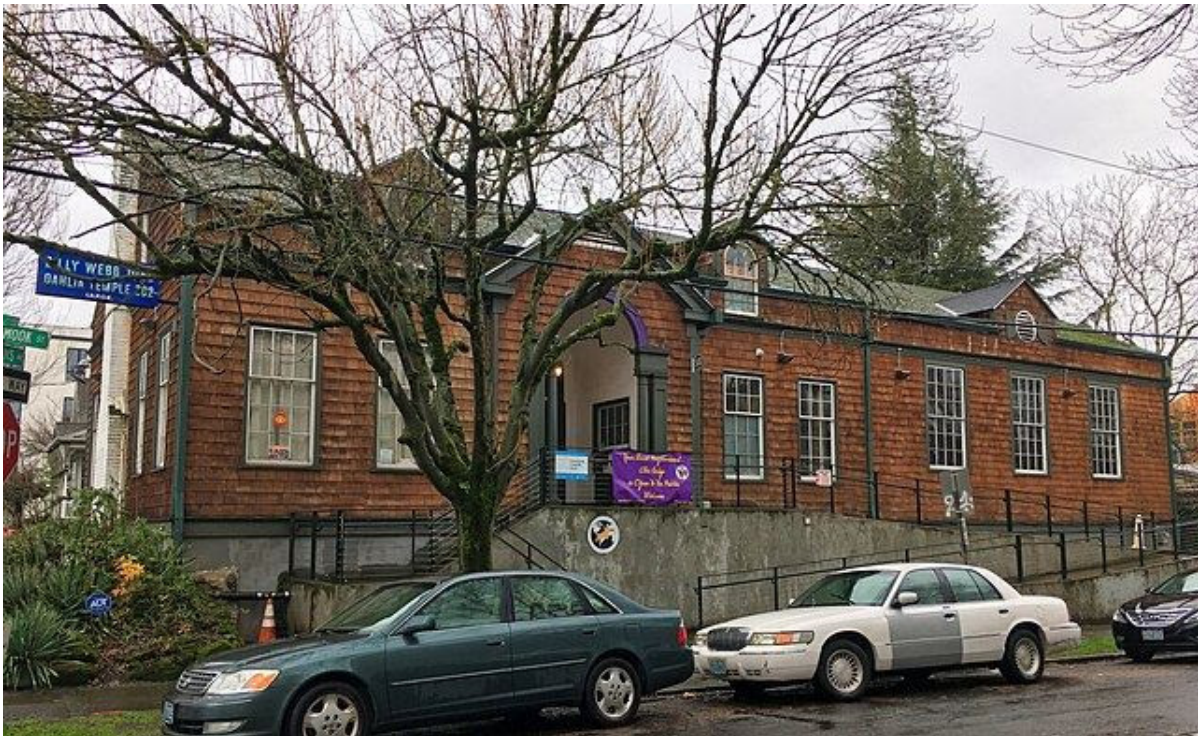
Williams Avenue YWCA/ Billy Webb Elks Lodge

New African American National Register sites in Portland