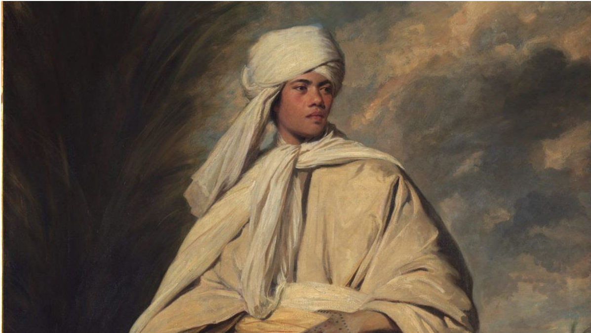
Detail from Portrait of Mai (Omai), (c.1776) by Sir Joshua Reynolds.

London's National Portrait Gallery and the Getty Museum in Los Angeles, CA have announced plans to jointly acquire the Joshua Reynolds masterpiece, Portrait of Mai (Omai) (c.1776), describing the partnership as a "new model of international collaboration."