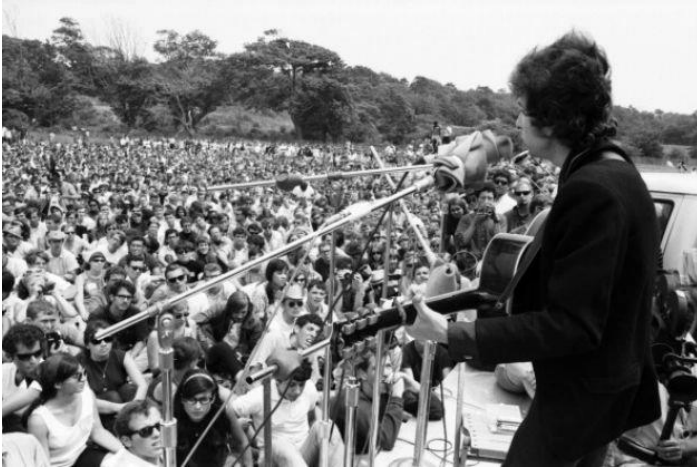
INCLUDING CULTURAL MARKERS