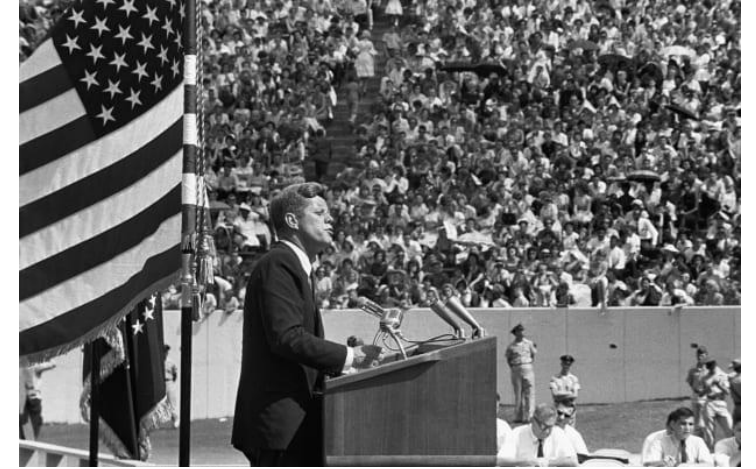
A DIFFERENT PERSPECTIVE ON "HOW THINGS WORK"