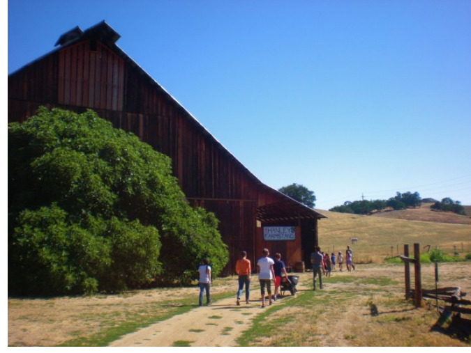
Summer camp attendees enjoy their days at the historic Hanley Farm.

A new and exciting partnership has recently been established between SOHS and Rogue Valley Farm to School (RVF2S). RVF2S is a nonprofit education organization that educates children about our food system through hands-on farm and garden programs. RVF2S hosted two weeks of summer camp for children ages 5-10 at Hanley Farm this summer. Each week children came to the farm ready to explore and learn about the responsibilities and rewards of farm life. During camp they participate in daily farm chores with the animals and in the gardens. Each day they create old-fashioned crafts and play heritage-themed games. They learn about changes in agriculture since the pioneer days through hands-on activities such as butter churning, wheat grinding, and seed saving, and by touring the Farm's historic buildings. Each day lunch is created, from harvest to table, together as a team. Additionally, starting this Fall, Hanley Farm will host weekly school groups from Jackson County through the RVF2S Harvest Meals program. This program offers school groups the opportunity for a 2-4 hour farm visit that includes educational activities in the field and kitchen where students participate in harvesting and cooking lunch at the farm. This new partnership has opened the doors for a much younger crowd of Rogue Valley citizens to learn about and create an appreciation for our agricultural roots, life on the farm, and healthy living skills.