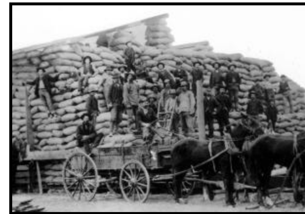
Pack your bags for the OMA Spring Meeting in Pendleton. Wheat is the main agricultural crop in the Pendleton area, and this photo from the Umatilla County Historical Society's Heritage Station shows how it was once transported.

And, of course, Pendleton is home to art galleries, live theater, and a symphony - all in a town of about 17,000 people. The OMA program committee and the Heritage Commission have sought to put together a program of interest to museums and heritage programs across the state. Grant writing, marketing, technology, funding issues and education are some of the topics that will be covered during the conference sessions. Tours are being planned, as are workshops in archives management, oral history and cemetery care.